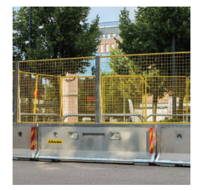
SVEA with Adaptable Fence Accessory