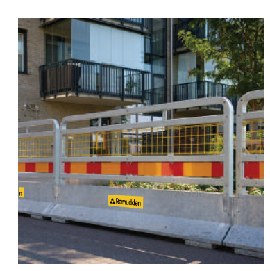
Torun Roadway Delineation Setup