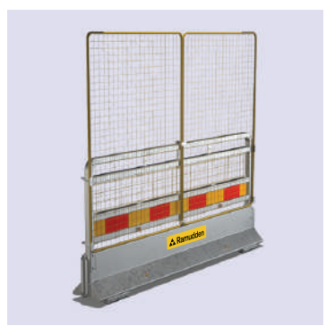
Torun with Adaptable Fence Accessory