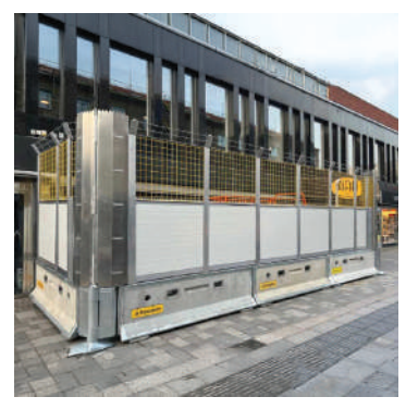
SVEA Complete Site Containment Setup