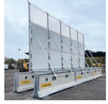
SVEA High Wind Load / Airport Operations Area Setup