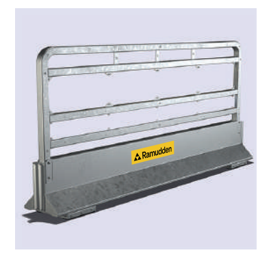
Torun City Barrier Bare