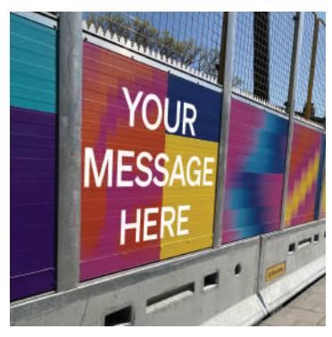
SVEA + SoundPanel with Custom Banner Wrap